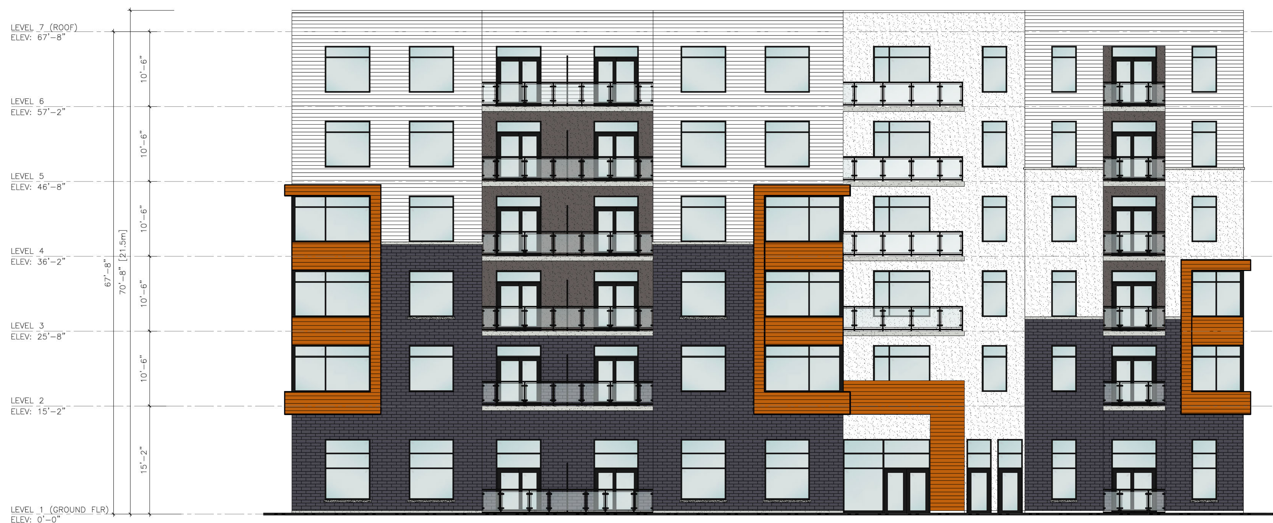
WEST ELEVATION SCALE: 1/8"=1'-0"