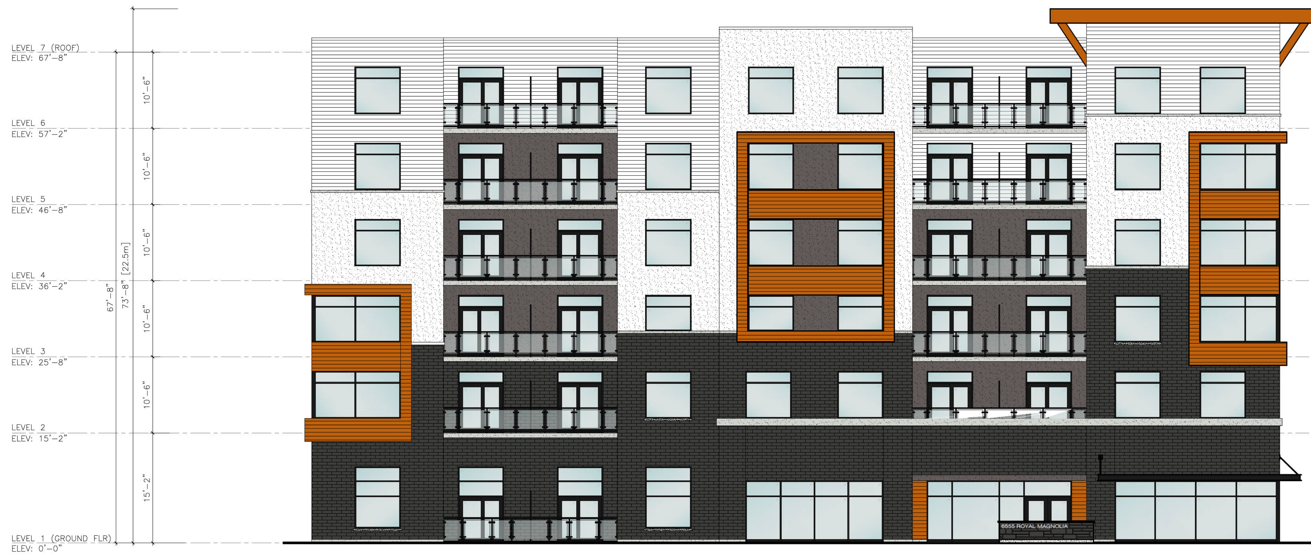
EAST ELEVATION SCALE: 1/8"=1'-0"