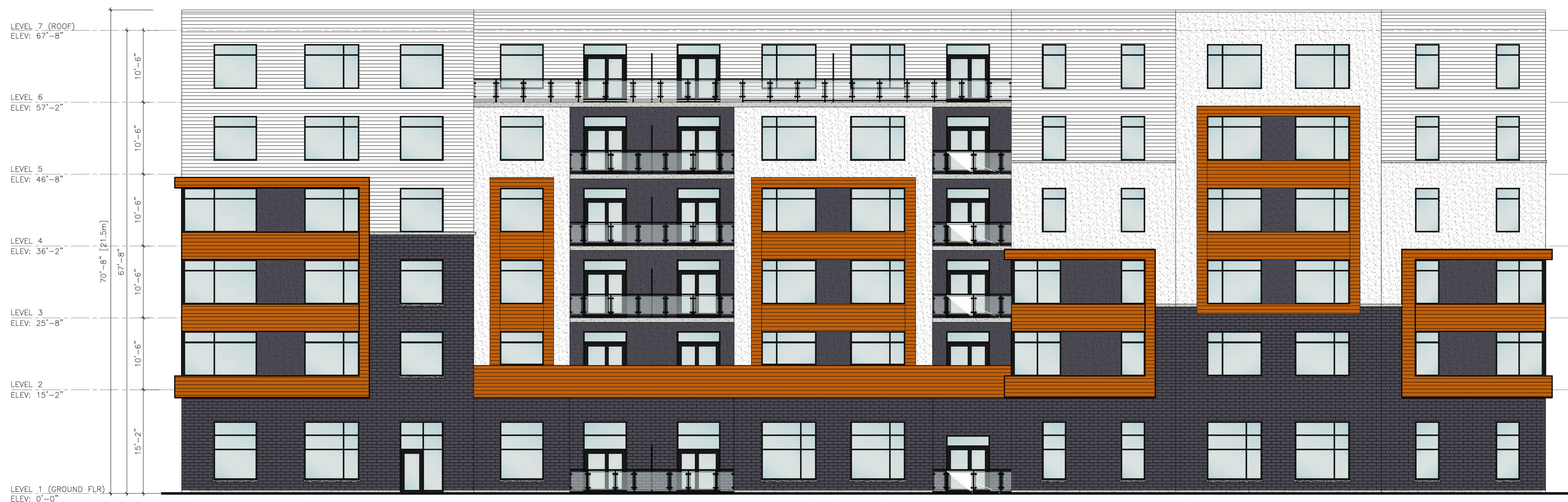
SOUTH ELEVATION SCALE: 1/8"=1'-0"