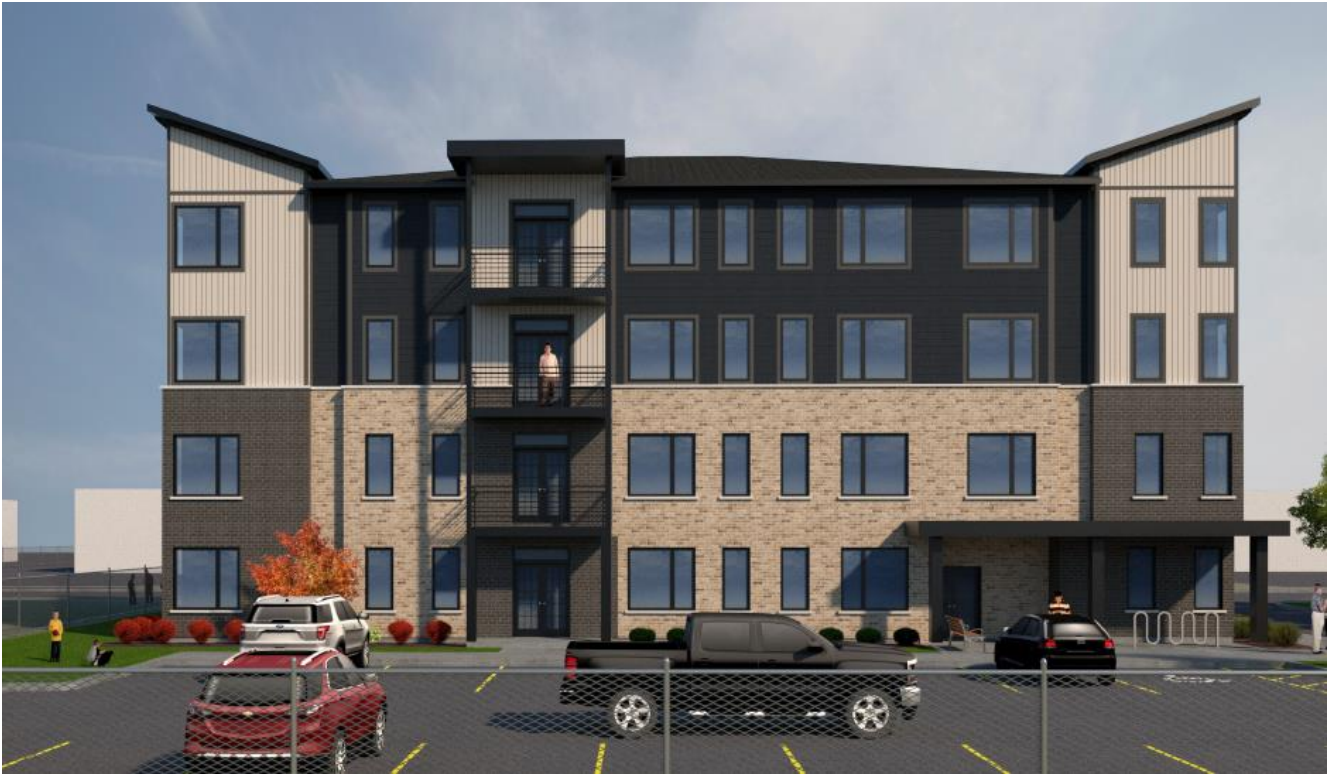
Conceptual Rendering – Rear View

The above images represent the applicant's proposal as submitted and may change.