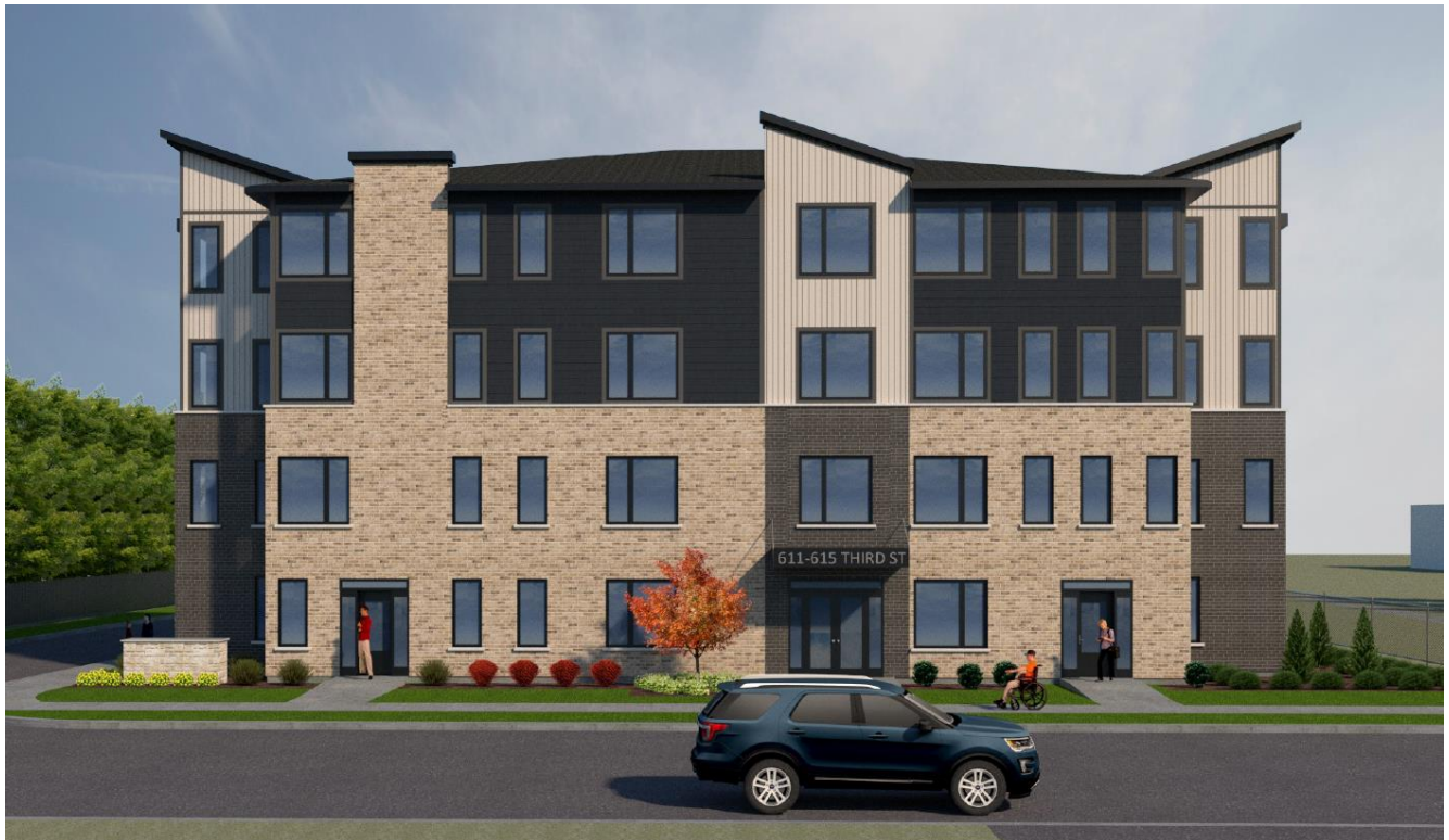
Conceptual Rendering – Front (Third Street) View