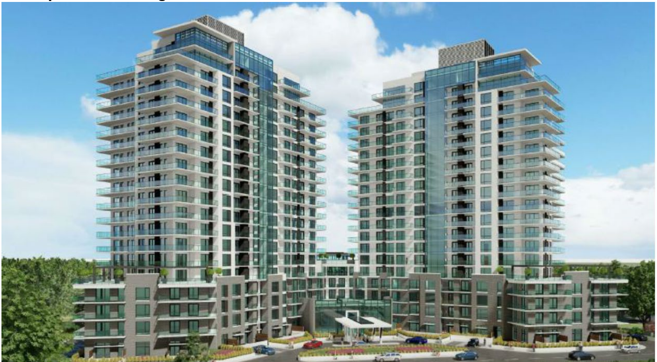
The above images represent the applicant's proposal as submitted and may change.