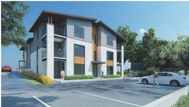
REAR PARKING LOT PERSPECTIVE