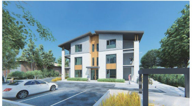
REAR PARKING LOT PERSPECTIVE