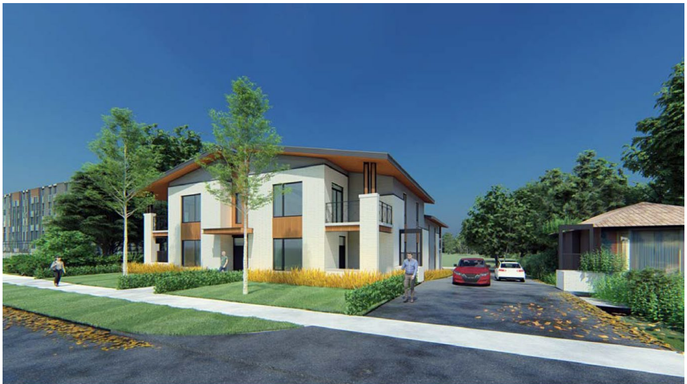
Conceptual Rendering – View from Sarnia Road

The above images represent the applicant's proposal as submitted and may change.