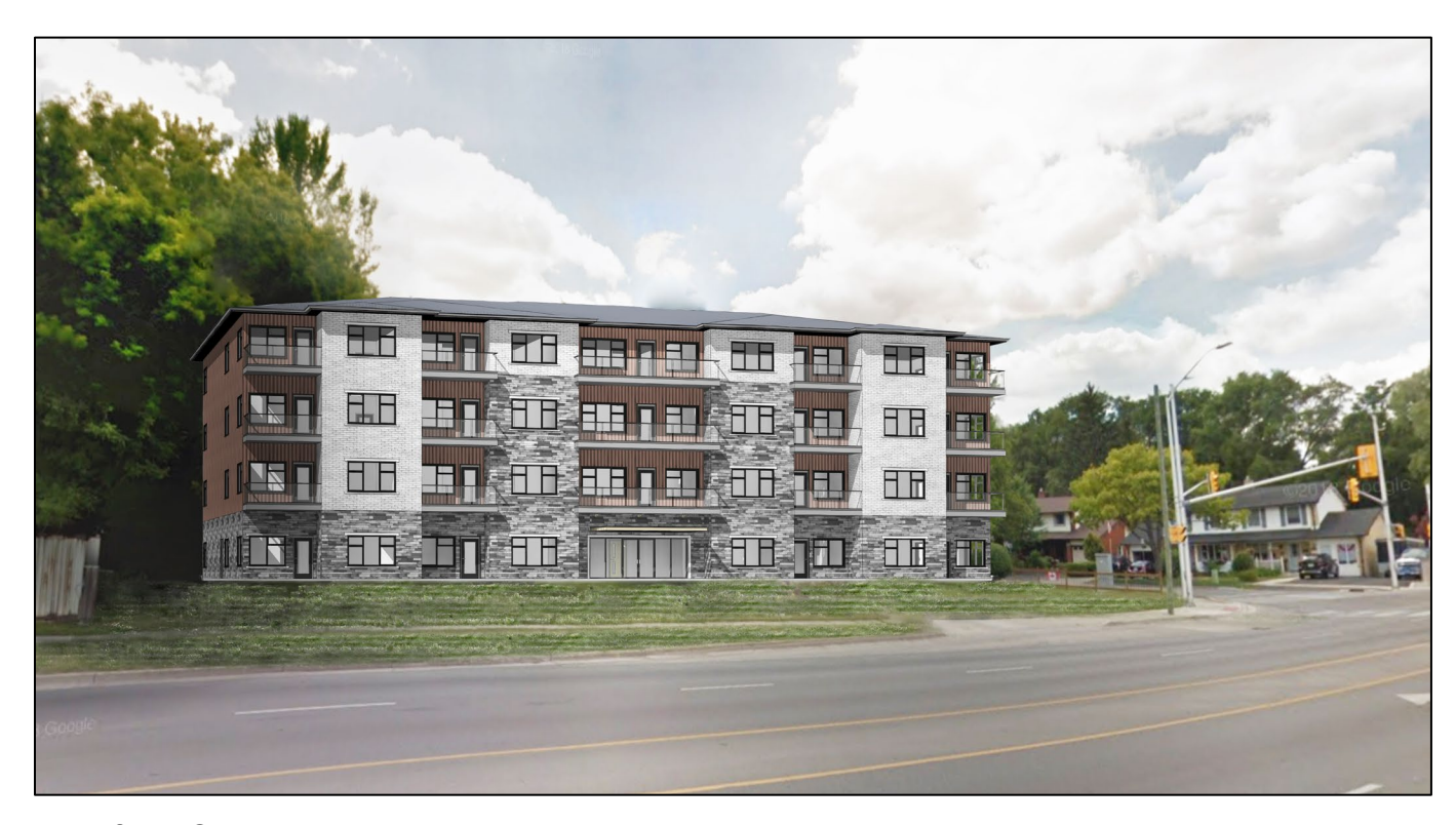
View from Commissioners Road West

The above image represents the applicant's proposal as submitted and may change.