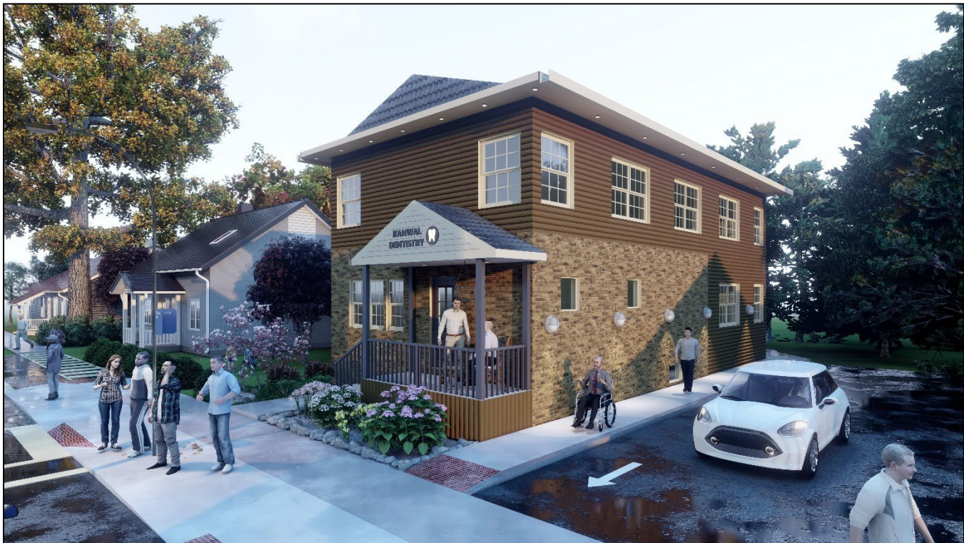
Figure 2. Rendering of proposed building