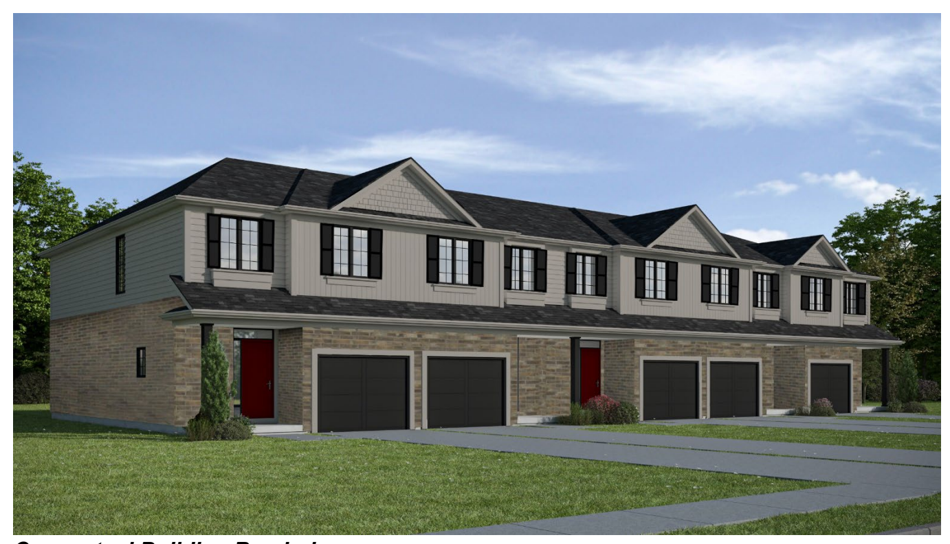
Conceptual Building Rendering

The above images represent the applicant's proposal as submitted and may change.