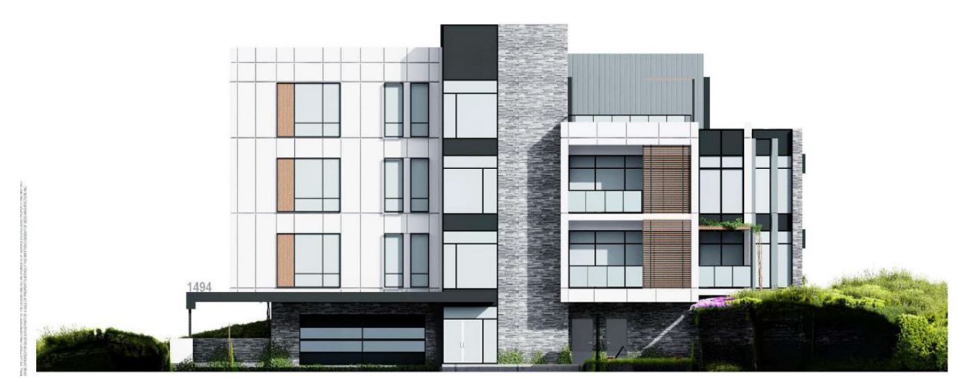
Figure 2: Elevations of the proposed apartment building.