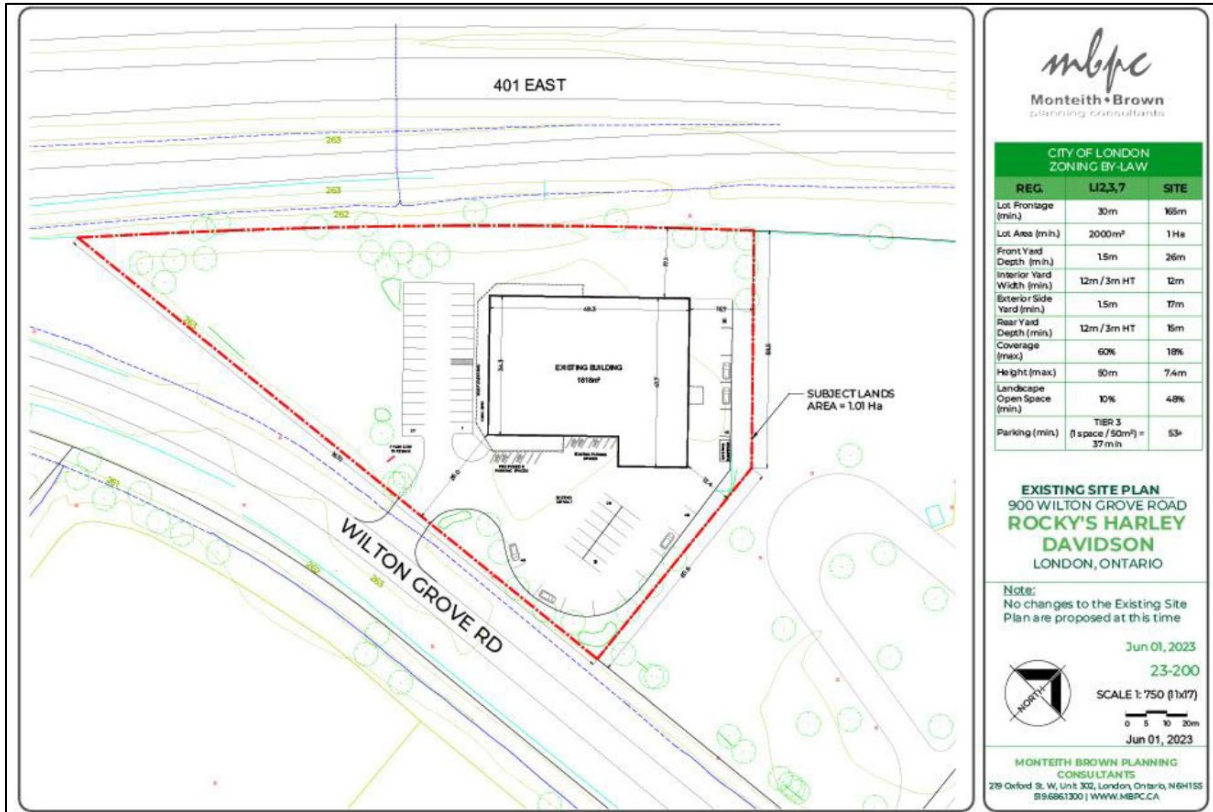
Figure 1: Site Layout

The above image represents the applicant's proposal as submitted and may change.