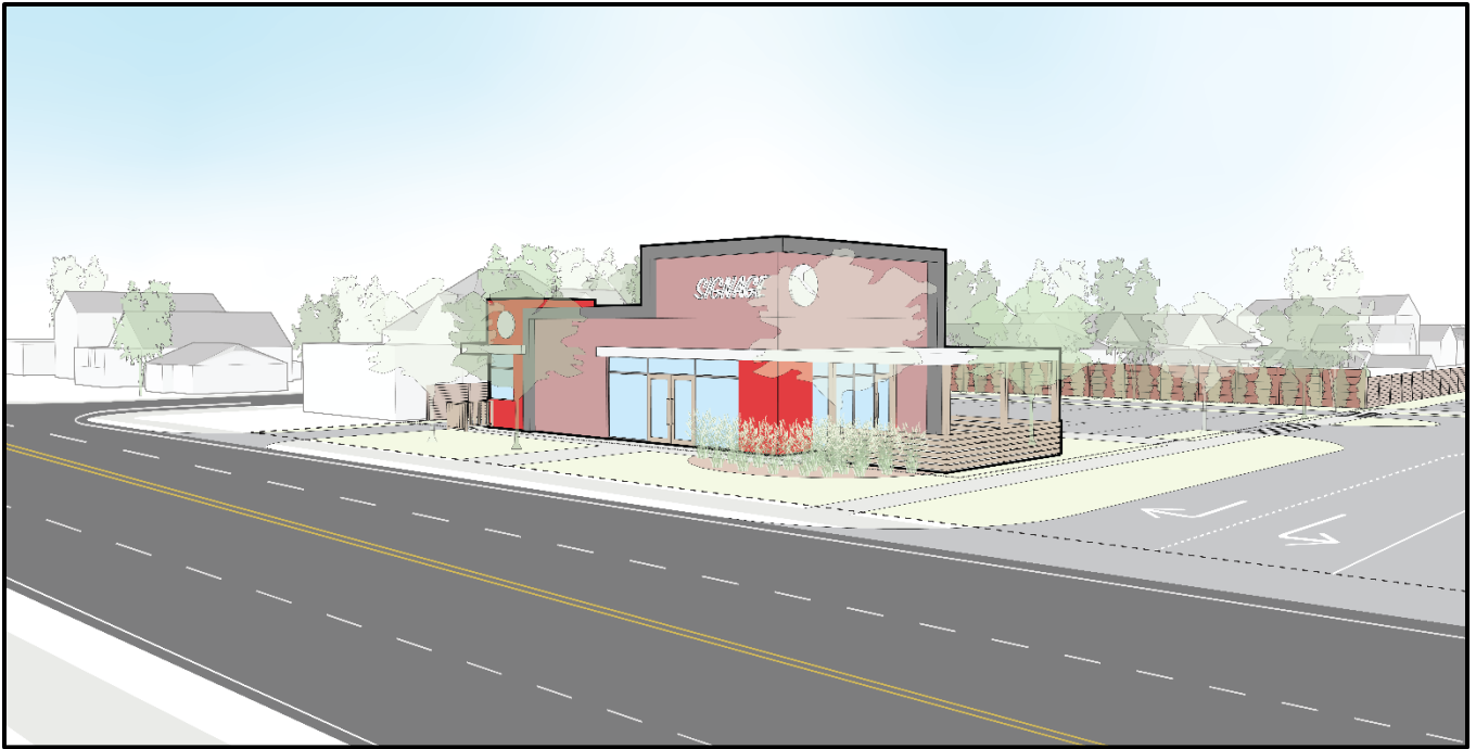
Figure 3. Rendering of Proposed Development.