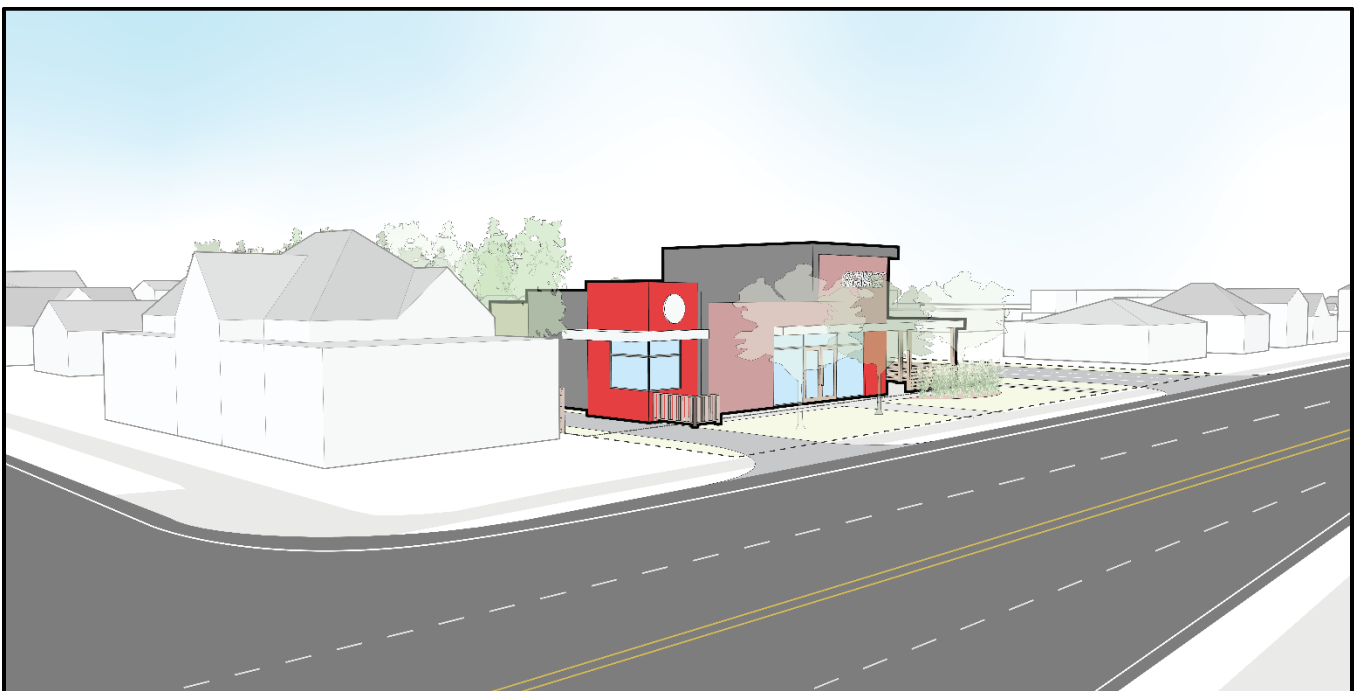
Figure 5. Rendering of Proposed Development.

The above images represent the applicant's proposal as submitted and may change.