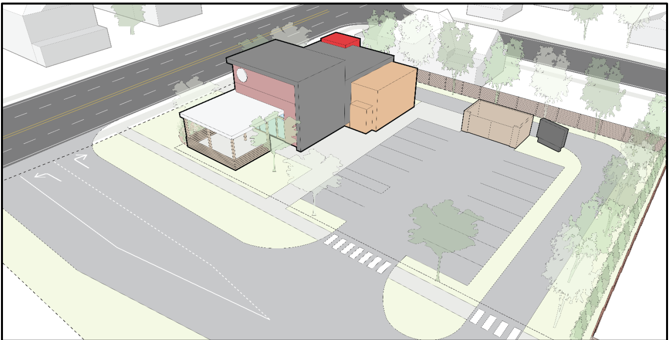
Figure 4. Rendering of Proposed Development.