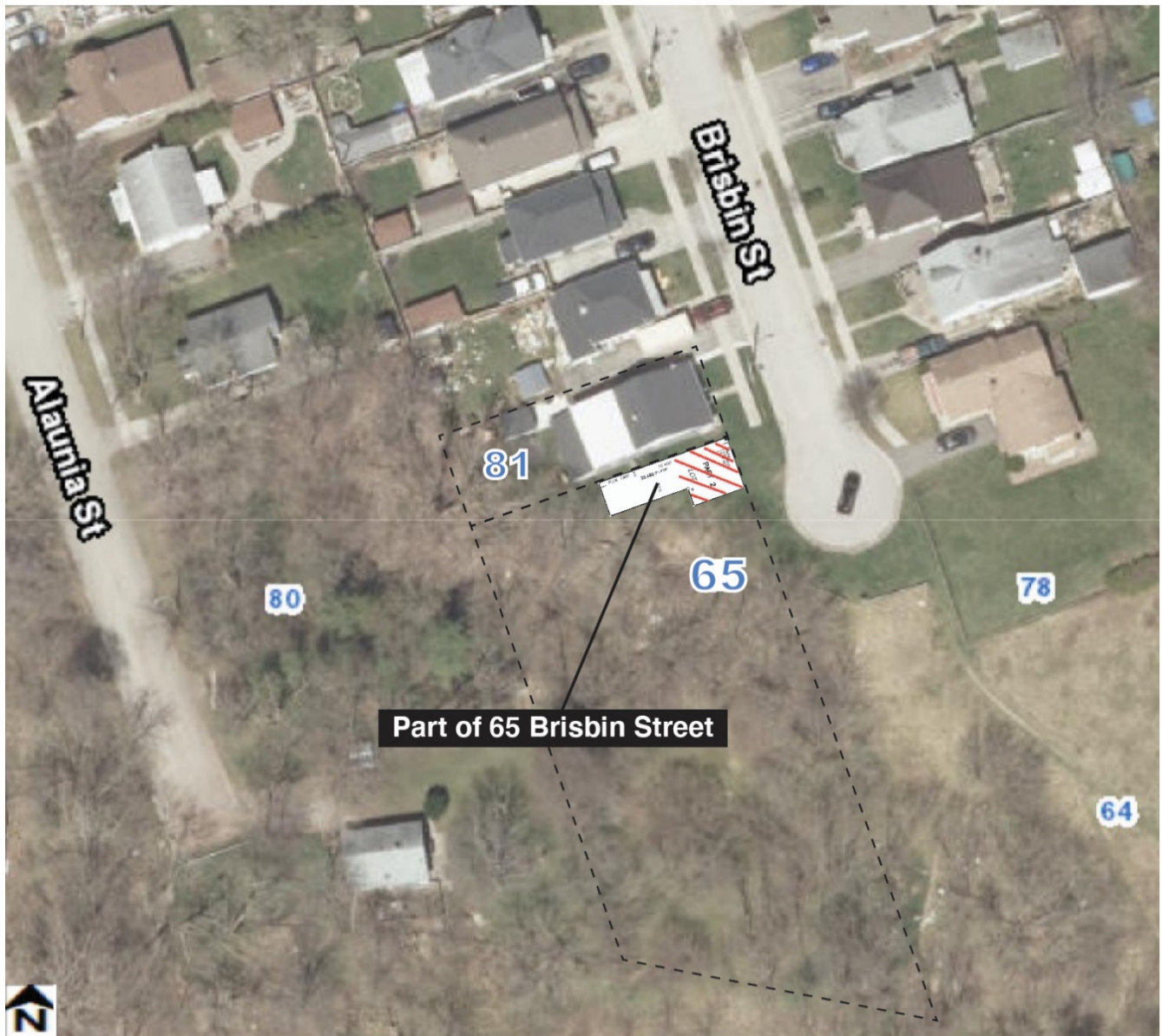
Aerial image identifying the portion of 65 Brisbin Street requested for rezoning.