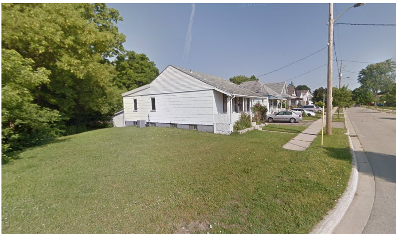
Streetview image of Part of 65 Brisbin Street (the vacant lands) and 81 Brisbin Street, looking north from Brisbin Street.