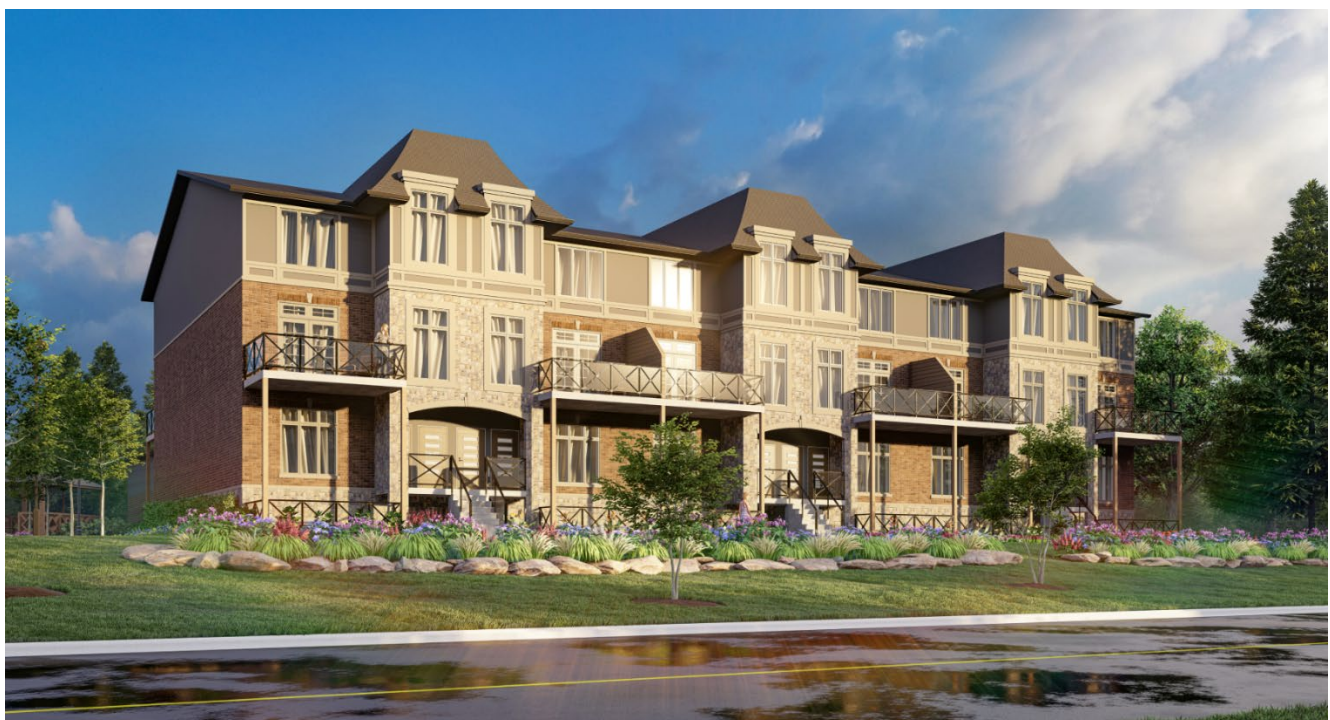
Conceptual Rendering – View from Byron Baseline Road

The above images represent the applicant’s proposal as submitted and may change.