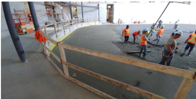
1. View Rink 1 concrete placement in progress.