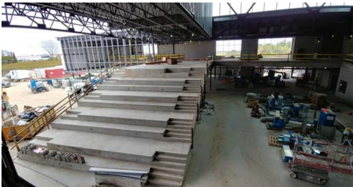
3. Gathering Area in progress.