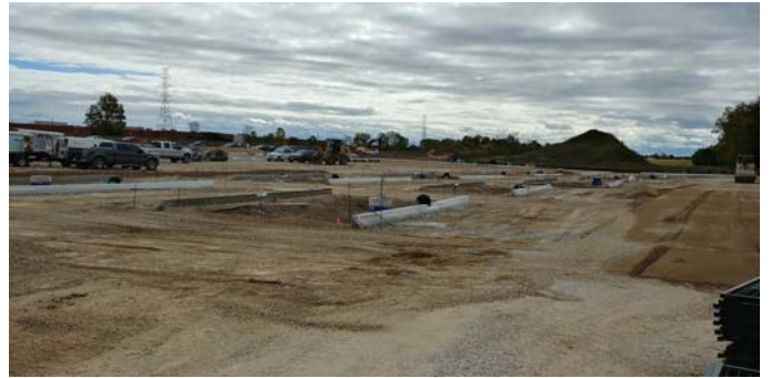
6. South parking lot curbs in progress.