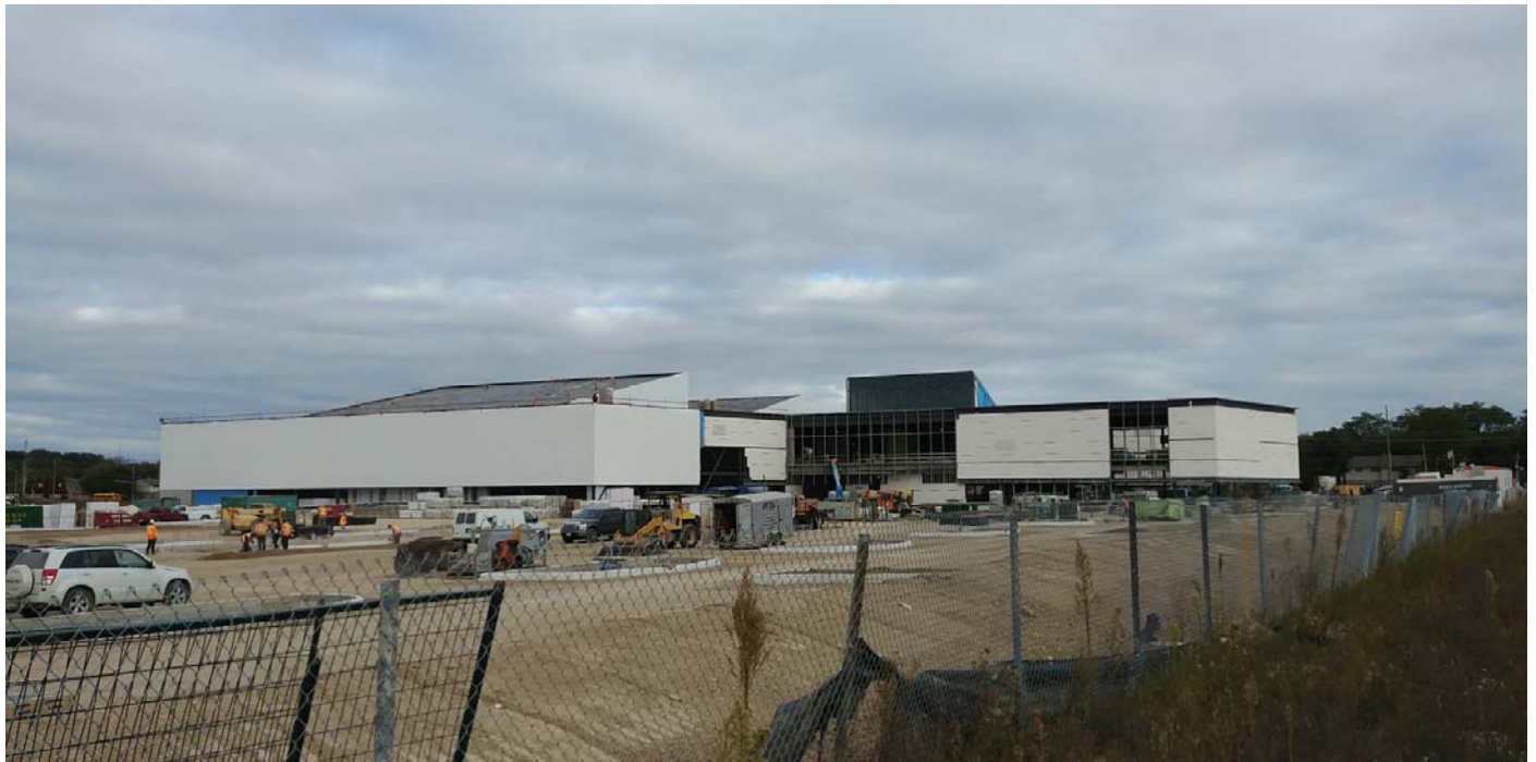
9. View of South of facility looking north to south entrance.