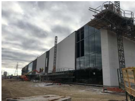
7. North façade masonry and curtainwall.