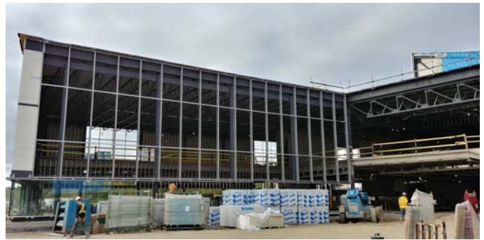
8. Curtainwall installation Library north façade.