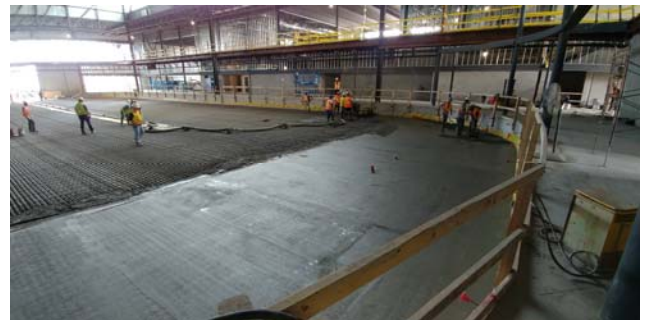
2. View Rink 1 concrete placement in progress.