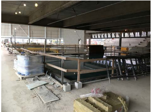
4. Leisure Pool water test in progress.