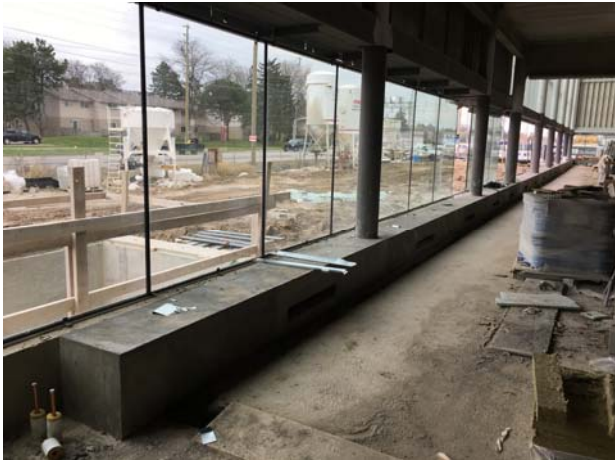
3. Aquatics Hall north bench seating.