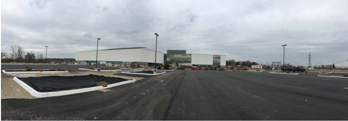
8. View from parking lot to South building entrance.