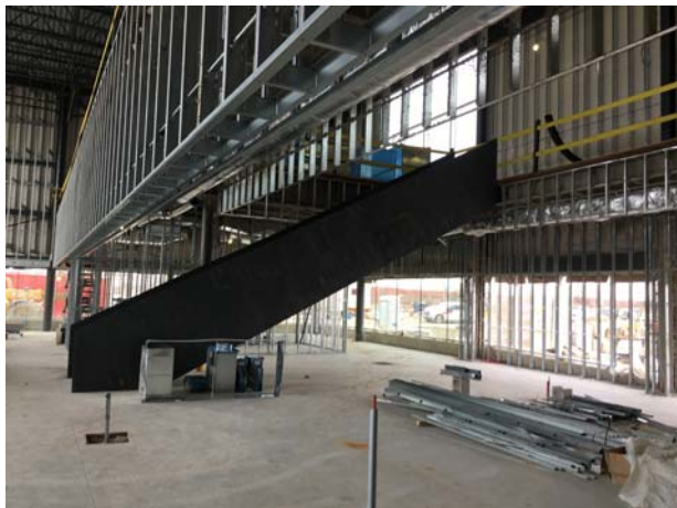
1. View of Library Mezzanine Stair