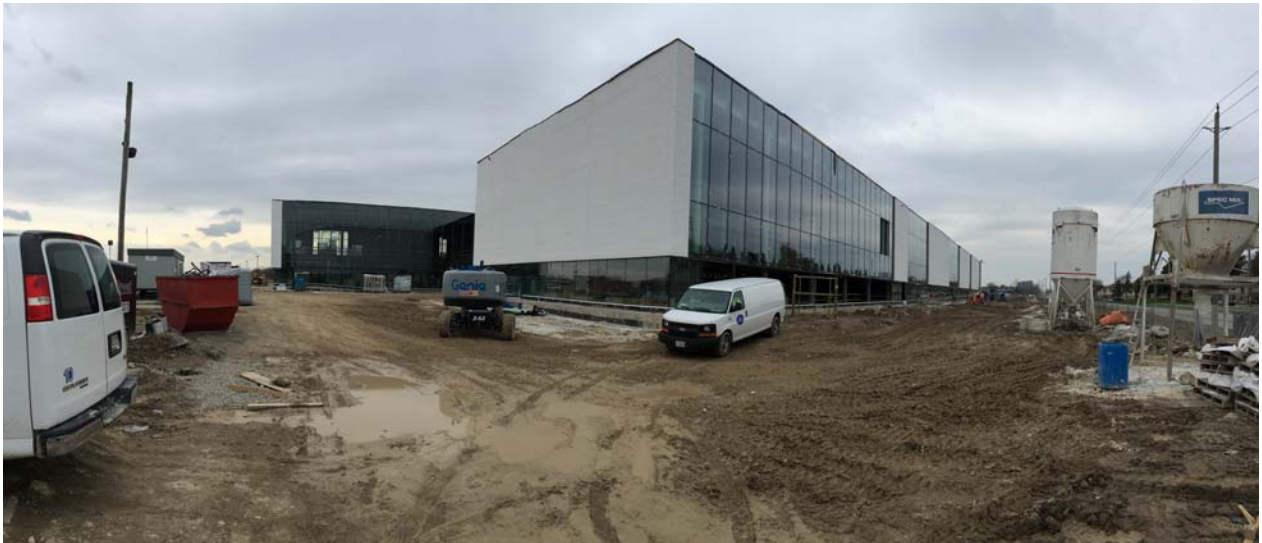
7. View to East Plaza.