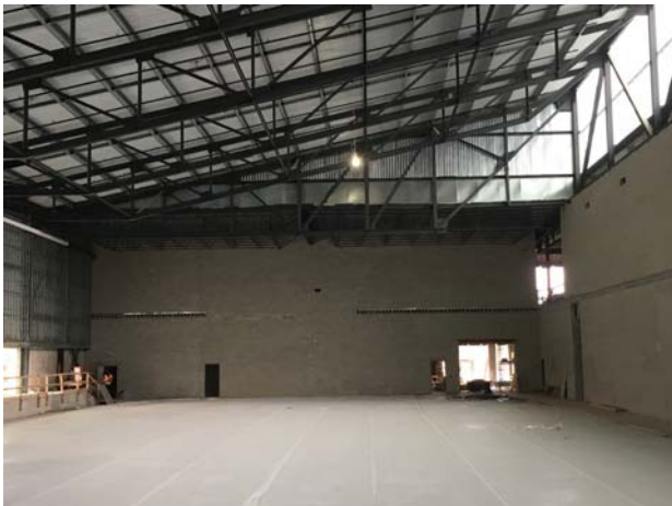
5. Rink 2 concrete slab and piping placed.