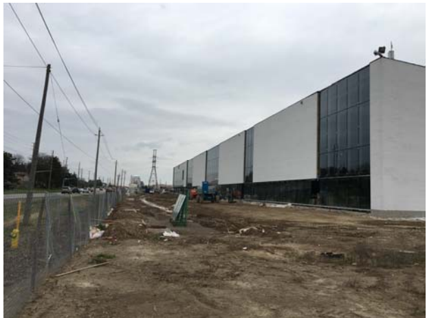
6. View of North façade.