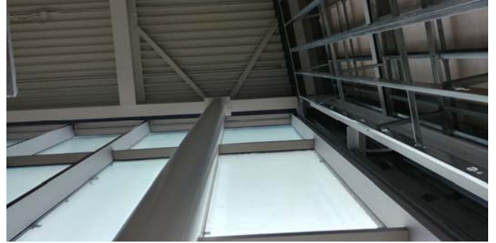
12. Library interior in progress

PREPARED BY THE CONSULTANT: MJMA / a+LiNK