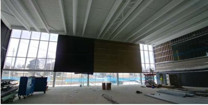
11. Gymnasium interior in progress