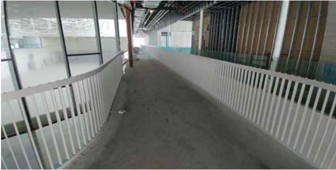
3. Rink 1 glazing