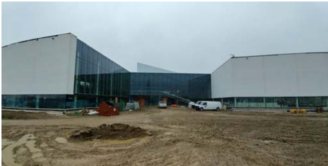
1. View of East Plaza