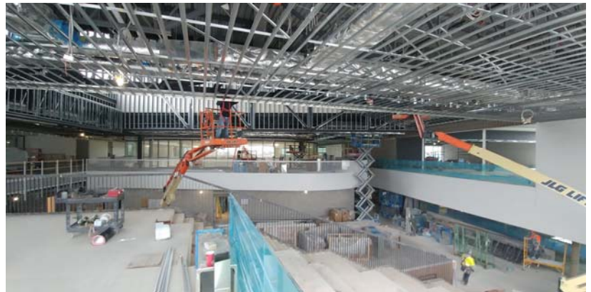
8. Leisure Pool ceiling under construction