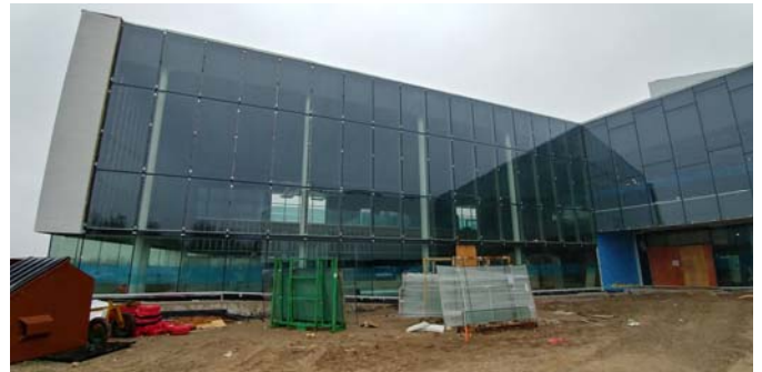
2. View of Library North façade.