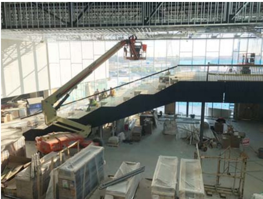
7. Aquatics Hall in progress