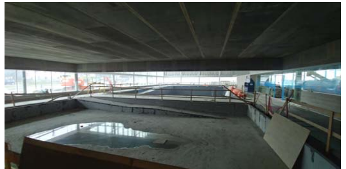
6. Level 2 – Fitness Area