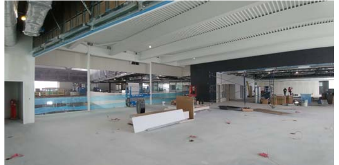
4. Rink 1 finishes under way