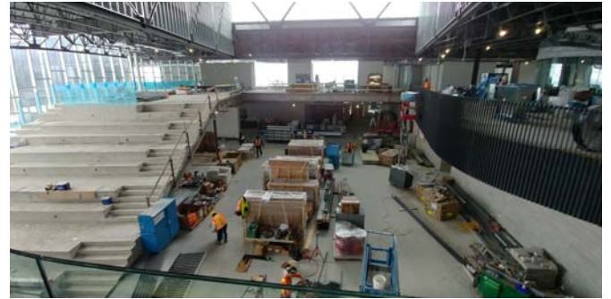
3. Gathering space railing for the Walking Loop to the right