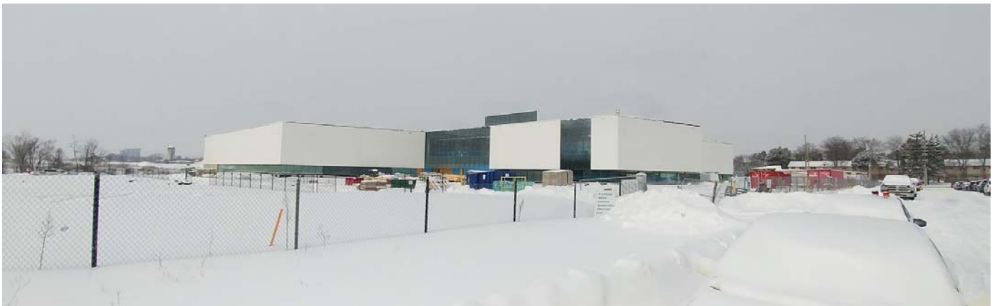
1. View of exterior looking northwest