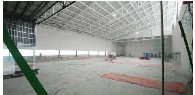
7. Rink 2 finishes under way