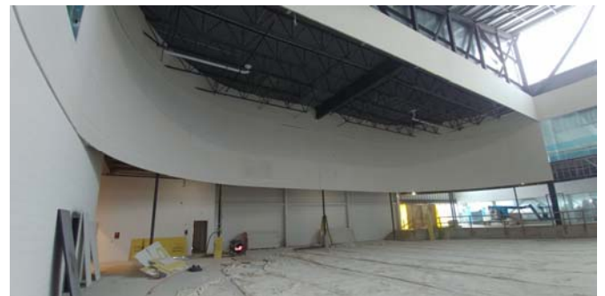
5. Rink 1 finishes under way