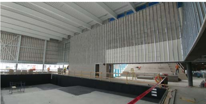
8. Aquatics Hall in progress