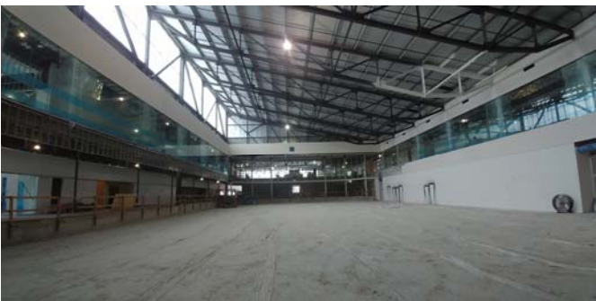
4. Rink 1 finishes under way