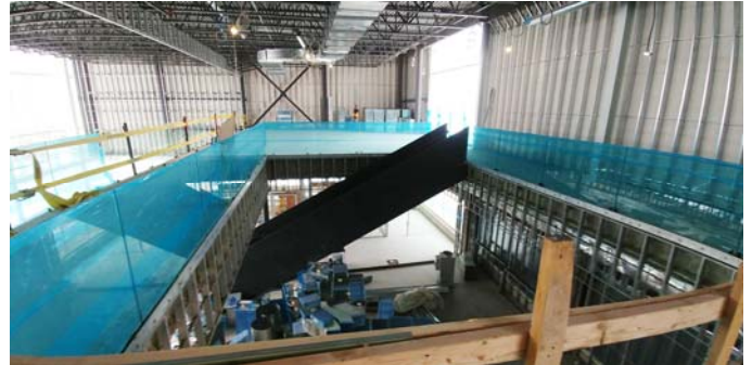
11. Library mezzanine glass installation in progress