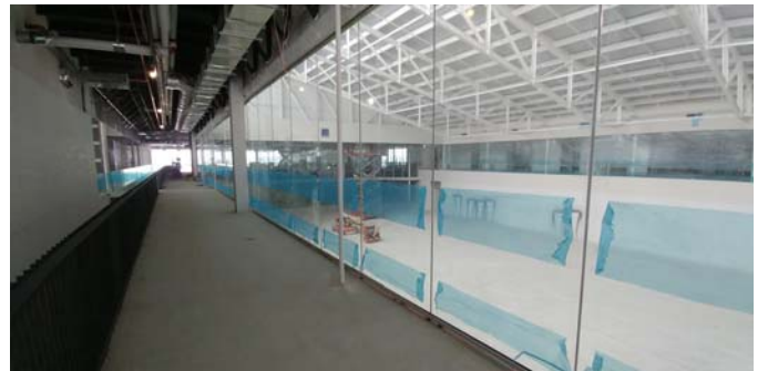
13. Walking Loop view into Rink 1