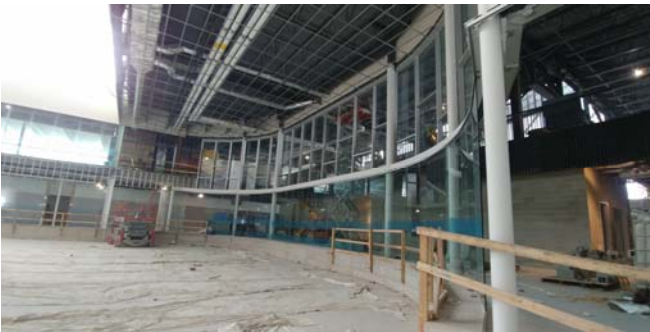
6. Rink 1 viewing area in progress