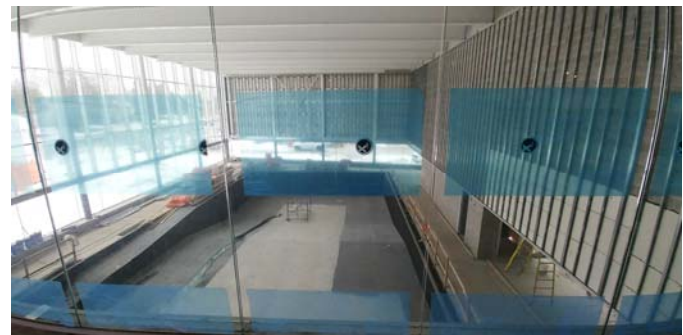
9. Open Fitness view to Aquatics Hall