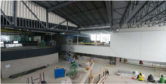
2. Gathering space framing under way