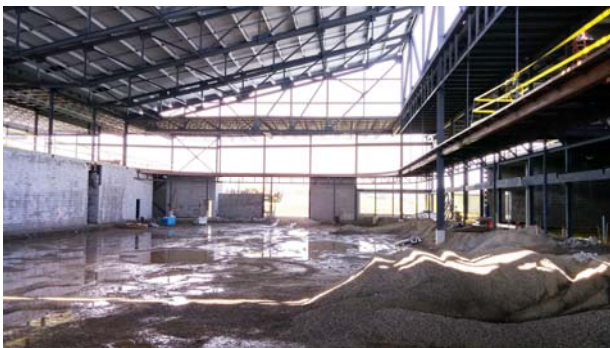
5. Rink 1 – enclosing with steel decking