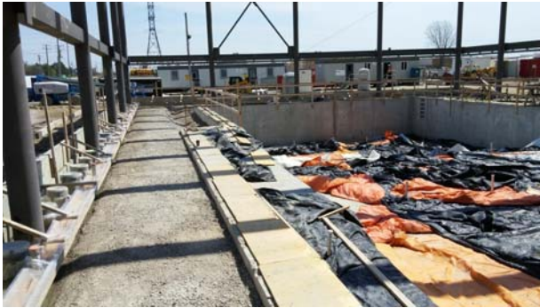
3. Lap pool – preparation of base for deck install