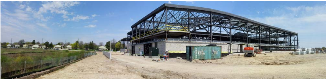
7. Rink 2 and back of house loading area