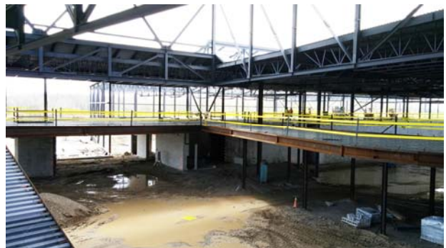
6. View from fitness across gathering area to Service London and walking loop.