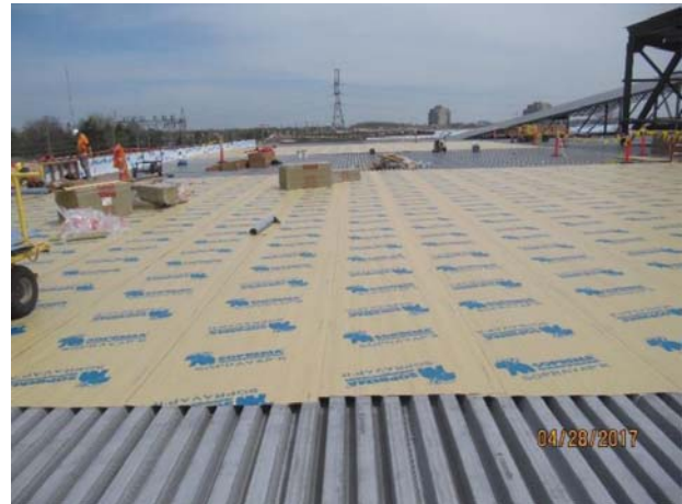
2. Roof view with skylight in the background.