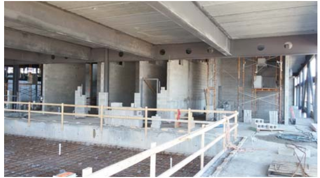
4. Leisure pool – preparation for concrete placement