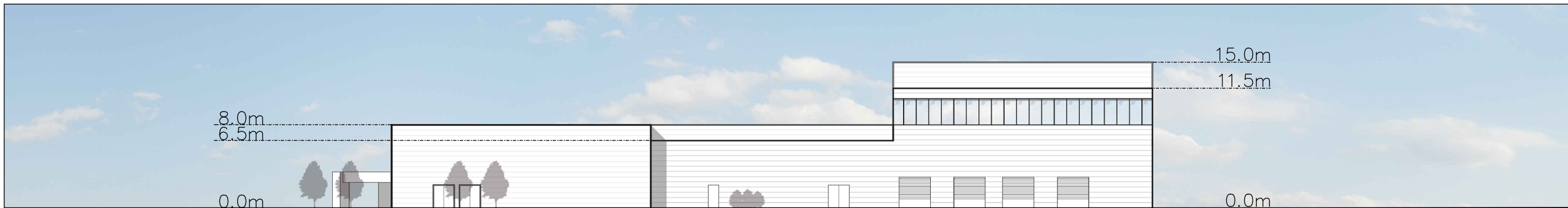
4 EAST ELEVATION 1:400