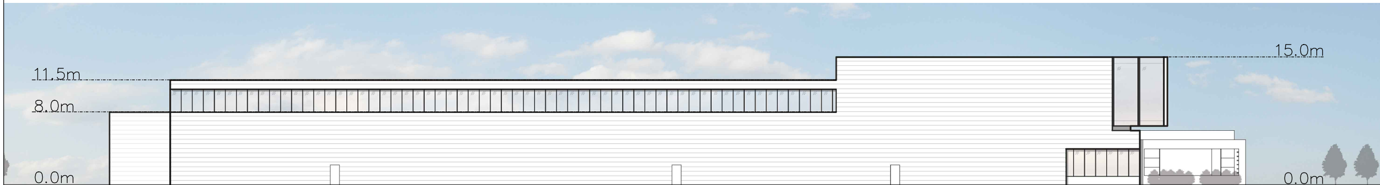
3 NORTH ELEVATION 1:400