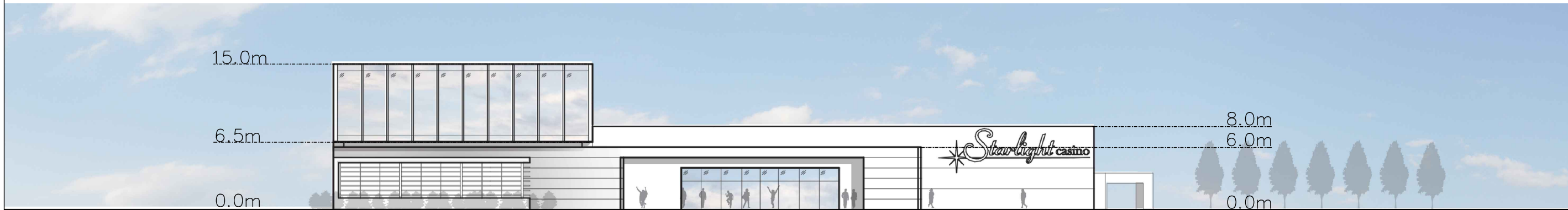
2 WEST ELEVATION 1:400