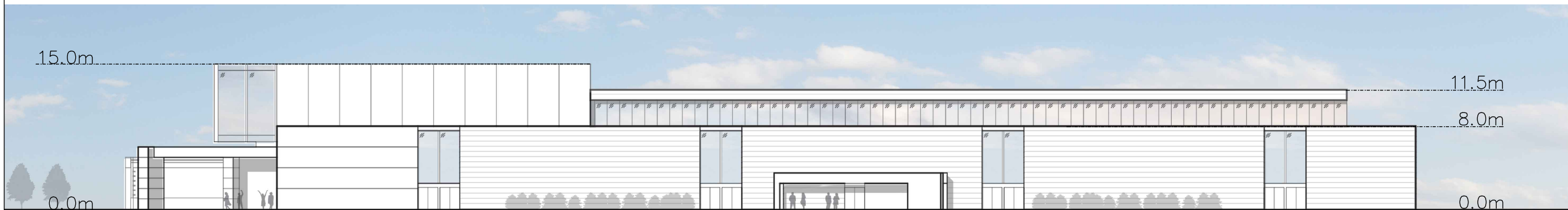
1 SOUTH ELEVATION 1:400