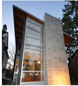
The Greenwood Res. 100 Baseline Road