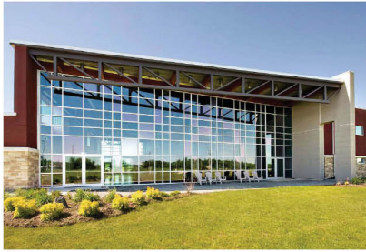
Gateway Church 890 Samia Road