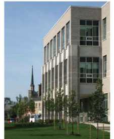
Support Services 1393 Western Road