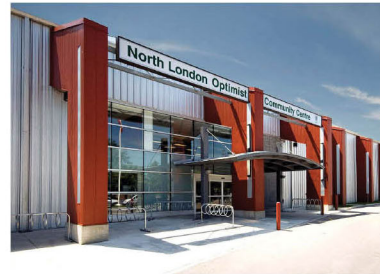
North London Optimist C.C. 1345 Cheapside Street