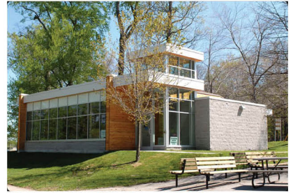
Springbank Gardens C. C. 205 Wonderland Road