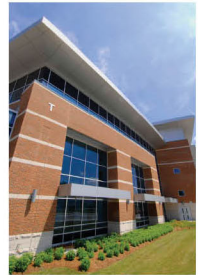
Buildings T & B Fanshawe College