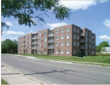
Homes Unlimited Nelson Street 570 Nelson Street