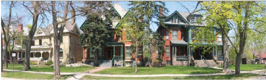
Princess Avenue Residential Buildings 300, 306, 308, 320, 322, 334-336 Princess Avenue and 549 Waterloo Street