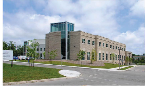
UWO Research Facility 900 Collip Circle