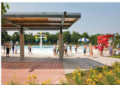
Thames Pool -Thames Park 15 Ridout Street