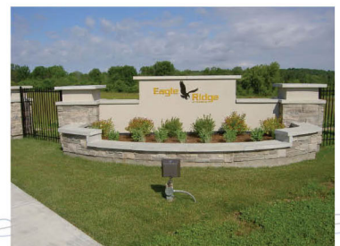
Eagle Ridge Gateway Feature Jim Allen Way