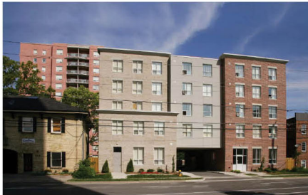
LIFT King Street 446 King Street